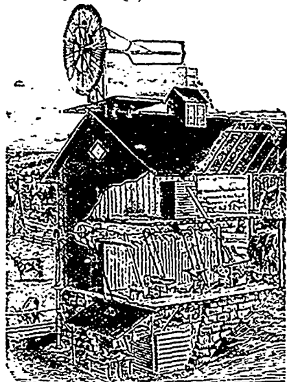
Geared Wind Mills, for Driving Machinery, Pumping Water, etc. From 1 to 40 horse power.