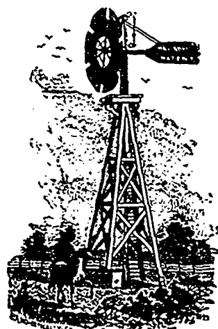
Halliday's Standard Wind Mills, 17 Sizes.

State what you want and send for Illustrated Catalogue.