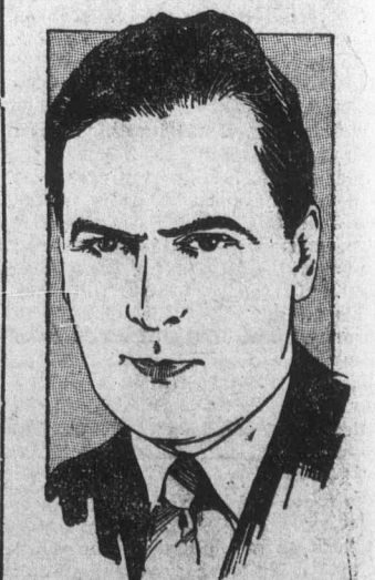
Thomas Meighan in Cecil B. DeMille's Paramount Picture "Manslaughter"

To be born into His world free from the condemnation of Adam's sin and to be under the blessing of Jesus, Paul calls "Justification of Life". This is a free gift of God and is a call of God to man to live as the sons of God. This is what Jesus calls the gospel of the King- dom, and this gospel or good news means that Jesus is come to seek and to save His own. Children belong to this kingdom. "Thou forget him and wander away, still He doth love us wherever we stray", for we are His. Paul says that to retain this privilege of "Justification of Life" it must produce faith in us and he quotes Abraham as an example of how the justified live by obedience. The whole story of Abraham offer- ing Isaac and the lamb is a beautiful study of how God justifies Himself and man.