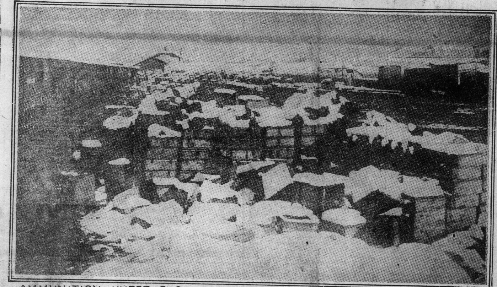
AMMUNITION UNDER SNOW CAPTURED BY THE GERMANS AT THE KRUSEVATZ

SCENE IN SERBIAN TOWN HELD BY TEUTON ALLIES