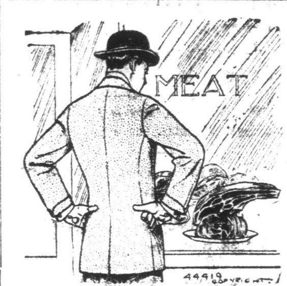
ARE YOU PARTICULAR

about the quality, freshness, delicate flavor and tenderness of the