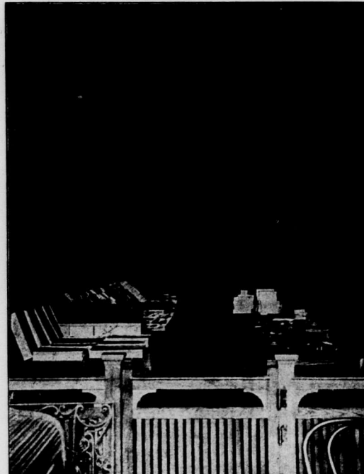
Ordinary glass made the store unrentable without artificial light.

A visit to our test rooms will furnish ample proof that these contrast pictures underestimate rather than exaggerate the lighting results of Luxfer Prisms. Write for our blank form and obtain an estimate of cost.