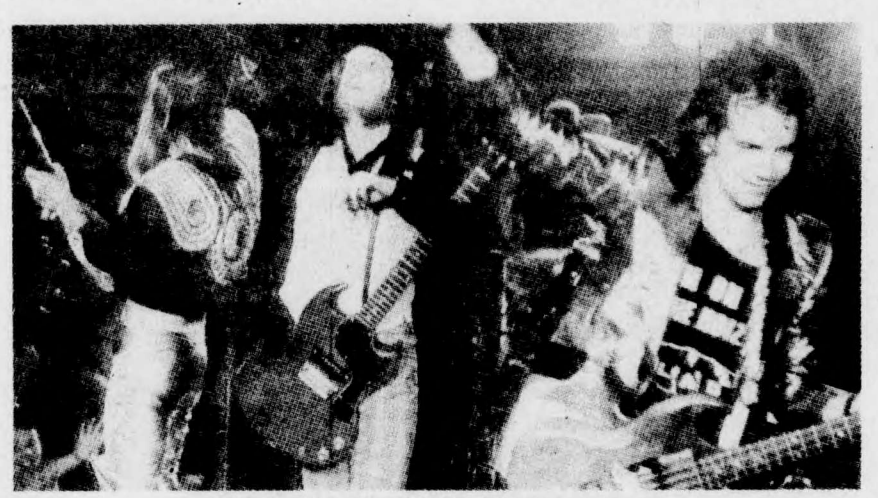
Slade at work, with Noddy in centre

It's a bit of a waste maybe, but a break might yet be coming. If it is, Sladest might become a belated first step instead of a recollection of a band that almost made it.