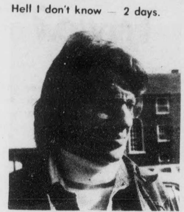
Bus. Ad. 3