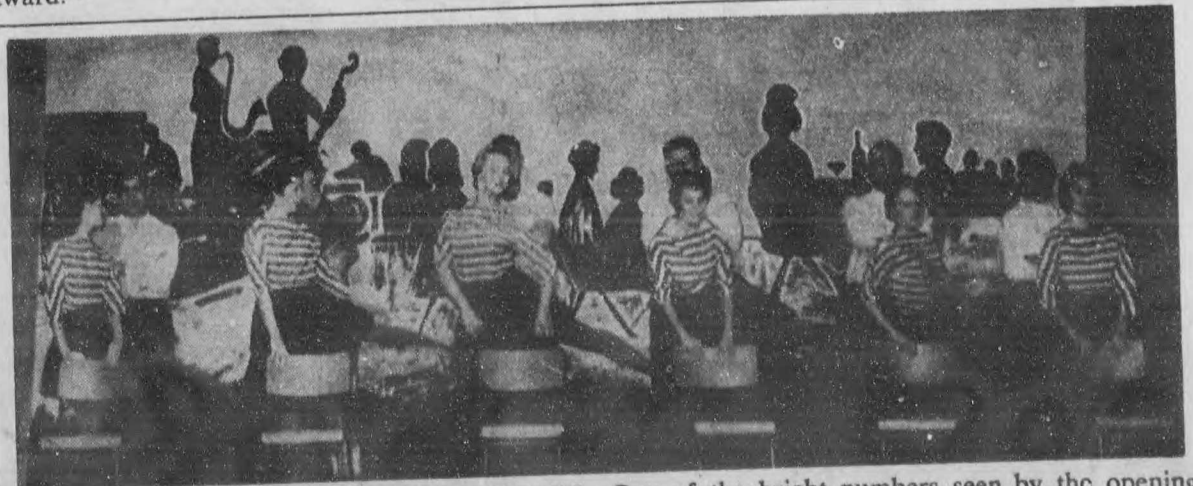
A GLANCE AT THE RED 'N' BLACK: One of the bright numbers seen by the opening night crowd was this "I Won't Dance" routine. Performances continue through tomorrow evening.