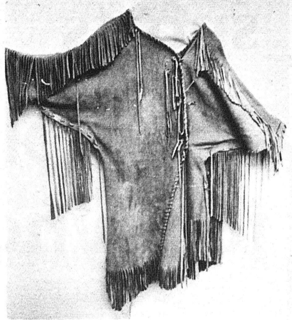
The creative clothing exhibition is one of three current showings at the U of A Art Gallery, Ring House No. 1.