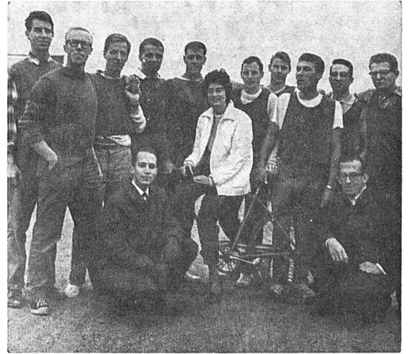
CONTINUING THEIR success, the intramural medical bicycle team won the hundred lap drag race, Saturday, Oct. 20.