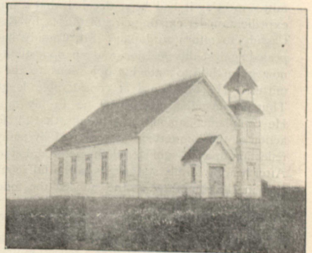
MISSION HOUSE AND INDIAN CHURCH AT NORWAY HOUSE, KEEWATIN.

four ounces. For circulars filled up in writing letter postage (three cents per ounce) must be paid.