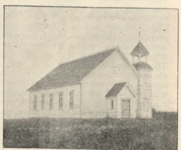
MISSION HOUSE AND INDIAN CHURCH AT NORWAY HOUSE, KEEWATIN.

four ounces. For circulars filled up in writing letter postage (three cents per ounce) must be paid.