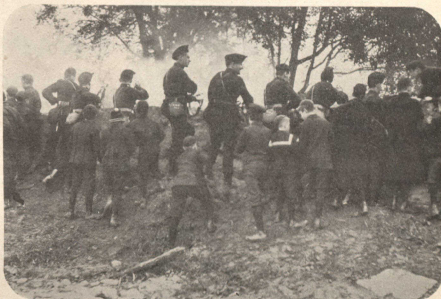
The small boy gathering cartridge shells.