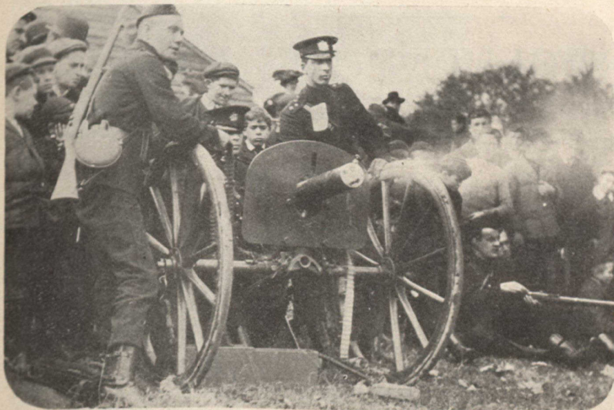
The Maxim Gun of the Q.O.R. at work.