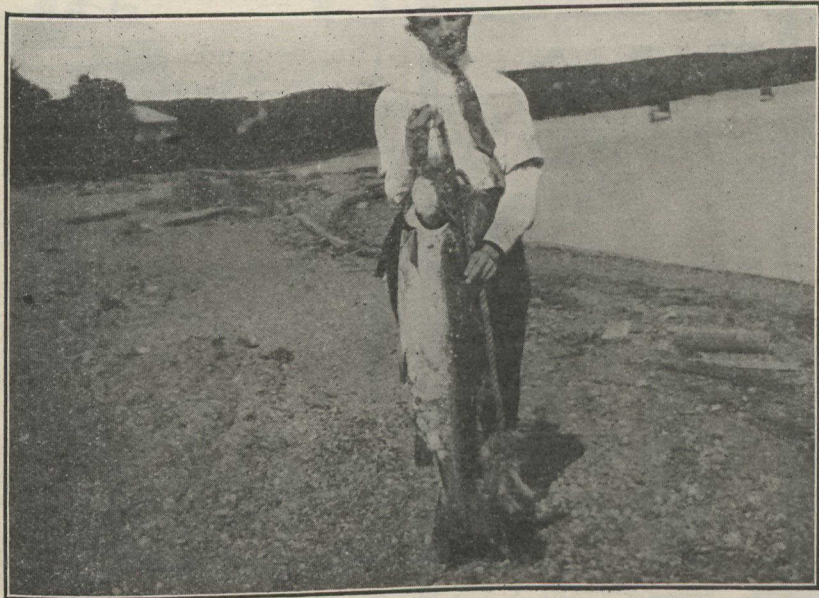
FISH THAT "GOT IN WRONG."

IN social circles of Ottawa, Montreal, Toronto, Winnipeg and Victoria, the grand dames are wondering what new fads will come in the wake of the new vice-regal party which next month will be in possession of Rideau Hall. Every change of Governors-General means slight alterations in