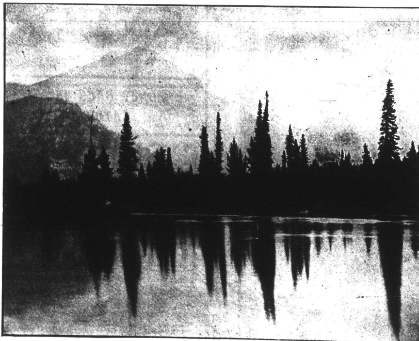
ON THE BOW RIVER AT BANFF.