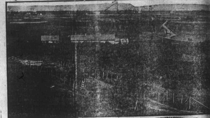
An Acadian Home.

ICH in the thinkney of strong men and herois wenters whose stir-ring adversaries by land and set the imagination aflame, ap-