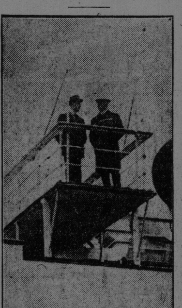
This is the first picture taken of Canada's new governor-general in the dominion. It was taken on board the S. S. Empress of Ireland, and shows His Royal Highness in cloth cap in Canadian waters a little before he had landed.

No man can be a cynic until he has associated with a woman who is the real thing in that line.