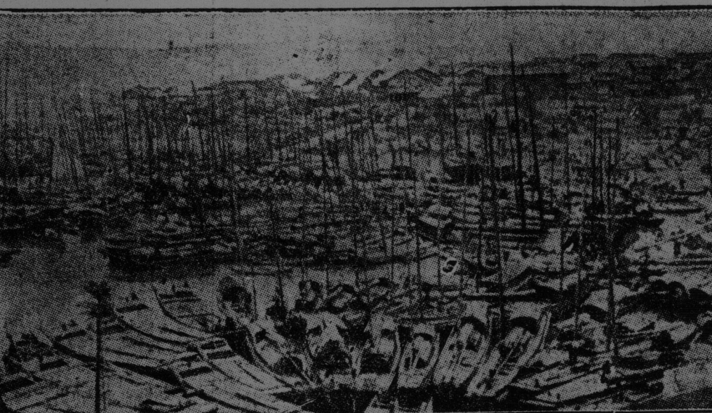
The City of Hankow, China, with a population of 800,000, was almost entirely burned last week by the revolutionists. Hankow is the centre of the revolt against the Manchu dynasty, by the republicans. The forest of masts in the foreground indicates to some extent the occupation of residents of Hankow. They are great freighters and forwarders on the river. When the revolutionists came along with the propaganda against invasion of foreign railroad building, they found a ready response among the river boatmen.