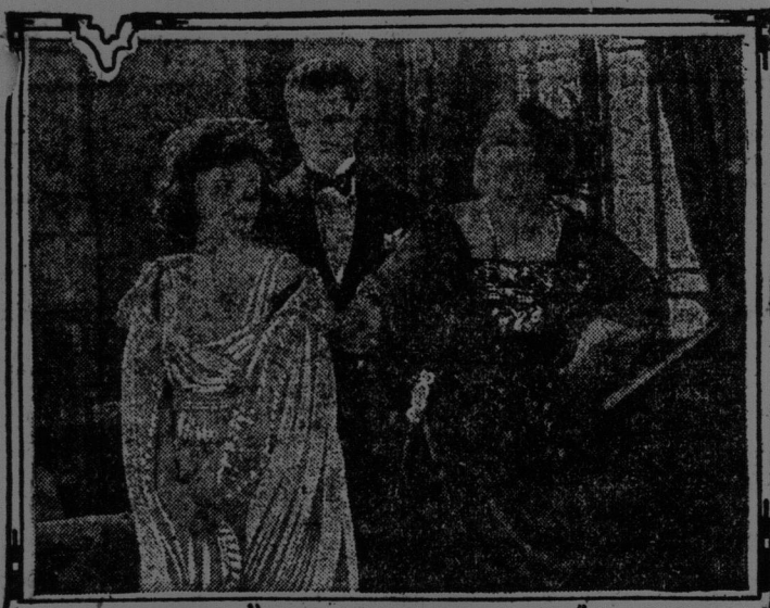
VERA GORDON in "THE GREATEST LOVE" Select Picture

Return of the Screen's Greatest Mother VERA GORDON HERE MONDAY