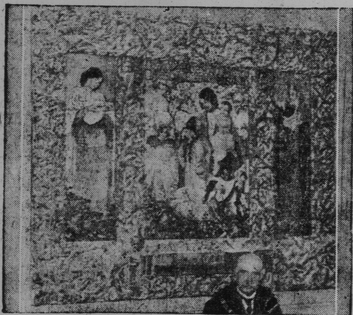
The Mayor of Shoreham, England, unveiling a tablet at the Shoreham infirmary, in memory of a gallant British nurse, Edith Cavell, who paid with her life the penalty of the Hun's inhumanity.