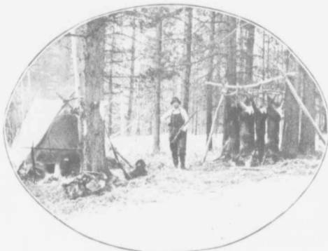
A Hunter's Camp

For the moment the lumber industry is in a depressed state following the past two years' reaction, but it will doubtless see