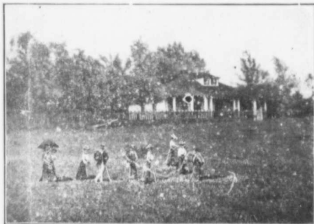
THE GOLF CLUB HOUSE