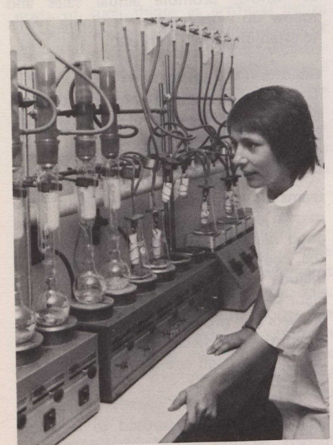
A technician surveys oil seed processing.

Canola is the result of a concerted effort by Canadian plant breeders and researchers to improve on rapeseed and overcome the disadvantages of high erucic acid and