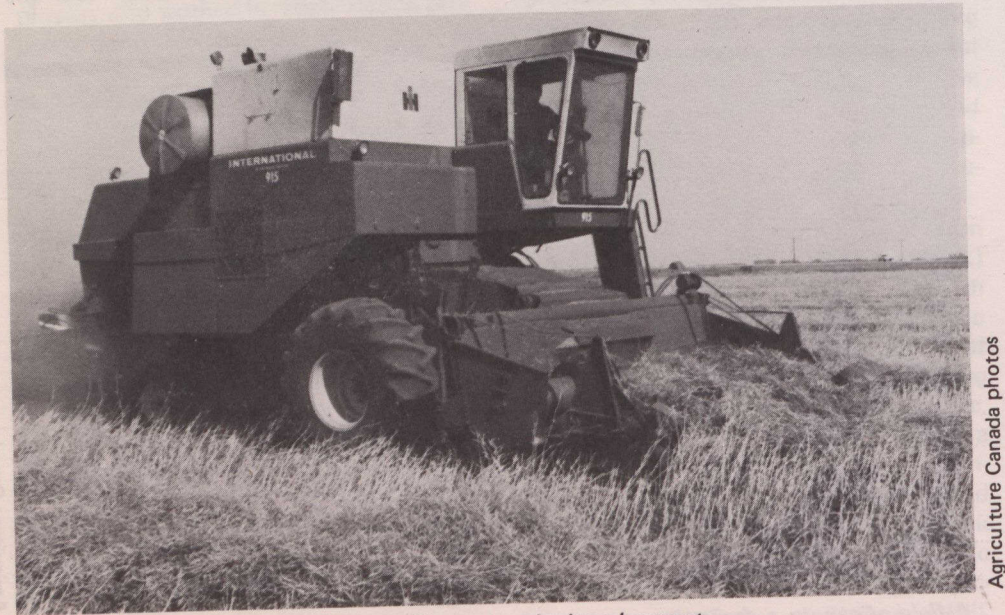
Harvesting canola - Canada's second largest agricultural export.

Siegfried Mielke, editor of Oil World writes: "With the new double-zero canola varieties, the quality of rapeseed oil and meal has become so good that their usage can be expanded at virtually any reason able rate. Apart from the size of supplies, it depends largely on the selling policy of Canadian growers and Canada's logistica ability to move supplies to consumers.