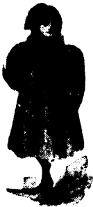
John Noble Knockabout Frock for girls

A well-made Costume Skirt in latest mode, with three box pleats and rows of tailor stitching at foot, for $1.60 . Postage, 40 cents.