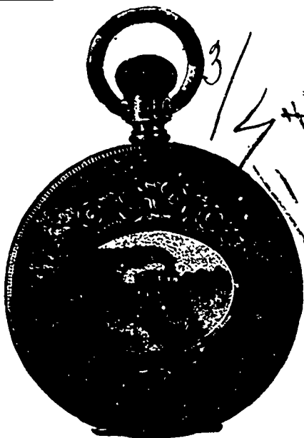
OUR "RAILROAD" WATCH

This Watch is a Perfect Time-keeper, UNQUALIFIED FOR A MILLION PURPOSES. It has 15 ruby jewels in such setting, Compensation Balance, Brought to Spring, Patent Pinion and Regulator adjusted to beat gold and platinum Double's time. Dial Stem wind and set. Guaranteed for five years. Fitted to our 14 Kt Gold Filled Hunting Case, warranted to wear equal to a 14 for 20 years. Price $25.00 Cash. Mailed to any address in Canada on receipt of amount, or on receipt of $10.00 we will forward by Express, 10.00 for balance, with privilege of Examination. The same movement fitted to our 14 Kt Gold Filled, open Face. Set in to retail and back Case, guaranteed for 20 years, for $27.00 Cash.