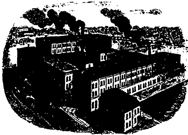
WORKS AT FORT WAYNE, IND.

Toronto Office, - - 138 King St. West. New York " - - - 155 Broadway. Buffalo " - - - 228 Pearl St.