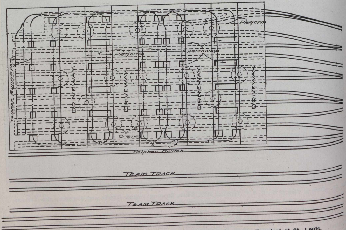
Fig. 10.—General Plan of Missouri, Kansas and Texas Terminal Company's Terminal at St. Louis.

the round trip of 3,000 feet. The average speed of each telpther would be 500 feet per minute, including all stops for picking up and setting down the loads and the maximum travelling speed 1,500 feet per minute.