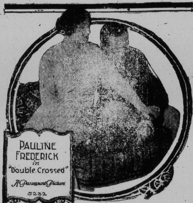
Happy Hour Next Wednesday

More Bread and Better Bread—and Better Pastry, too.