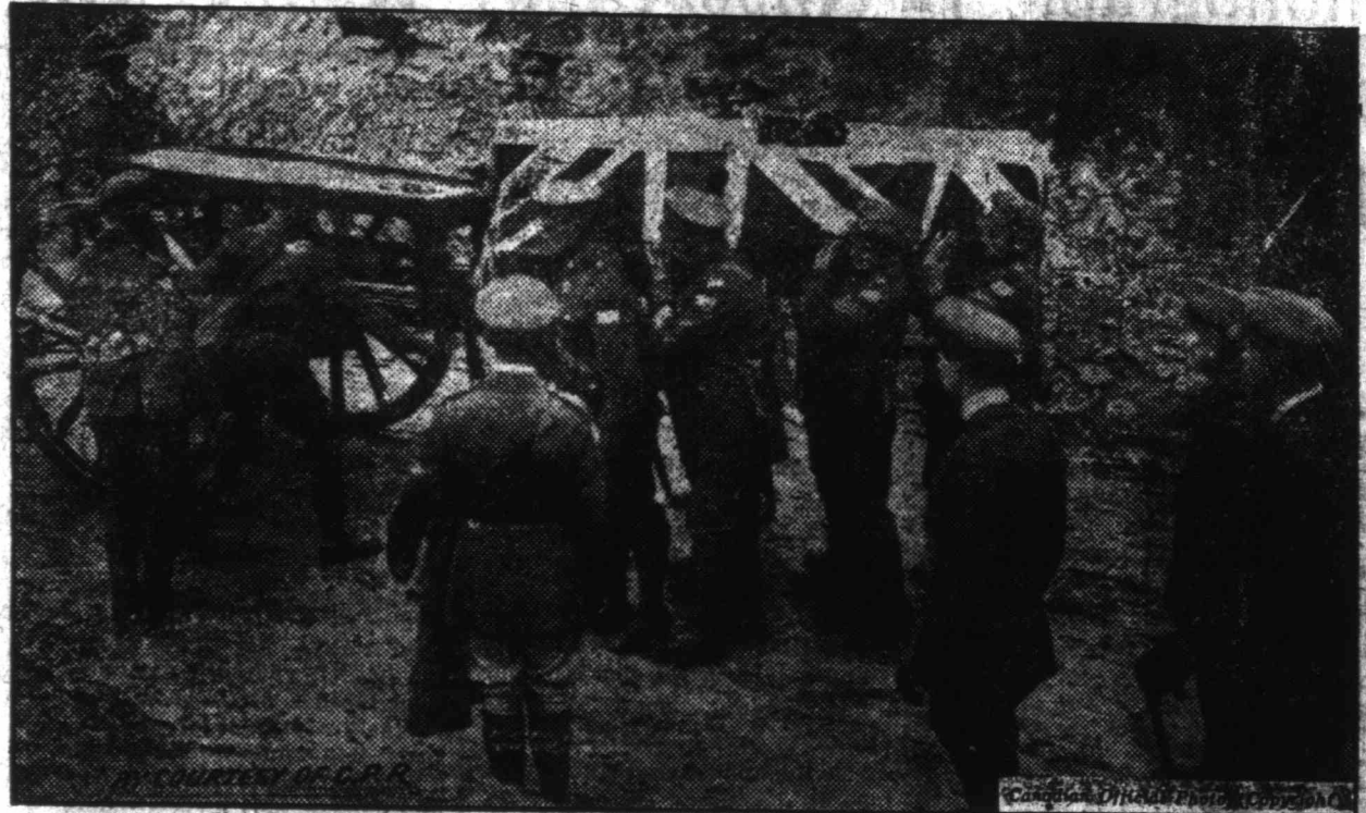
Funeral of General Lipsett near the lines. Taking the coffin from the gun carriage. H.R.H. the Prince of Wales following the coffin.