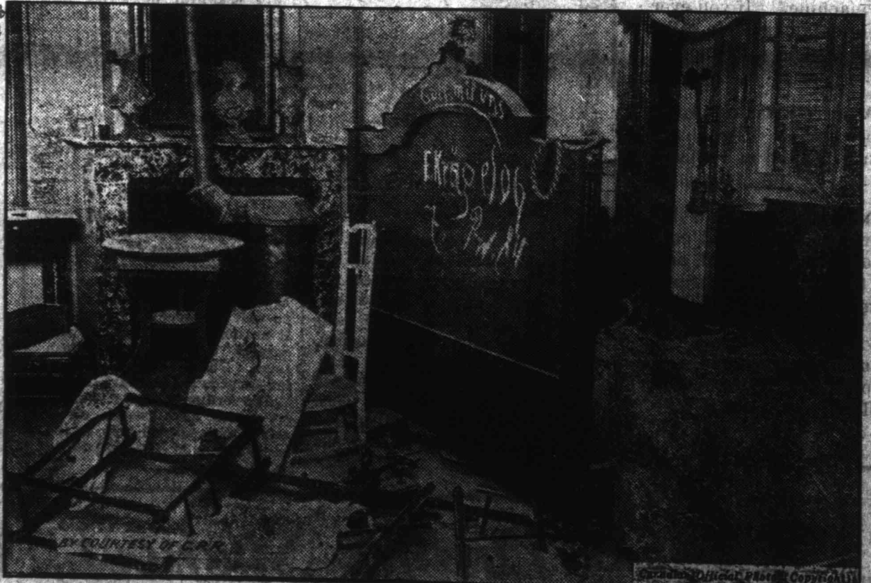
"Got Mit Uns": This German hall mark chalked by one of the Cambrai vandals on the bedstead of a pillaged room is a good example of German humor.