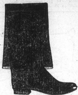
RUBBER BOOTS—All Kinds, All Sizes

is in the eating thereof." The proof of a good shoe is in its wearing qualities and the comfort it gives the wearer. A shoe that gives ease to the foot, and at the same time retains its original style and shape is a joy forever. These are the identical qualities which have made Cowan's Shoe Store famous. Our reputation for high-class, up-to-date goods was not made in a day, but by years of close contact with the shoe-buying public, and our long experience in buying from the manufacturers.