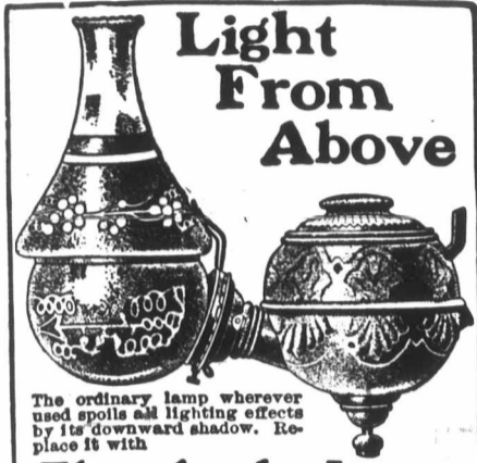
The ordinary lamp wherever used spoils all lighting effects by its downward shadow. Replace it with