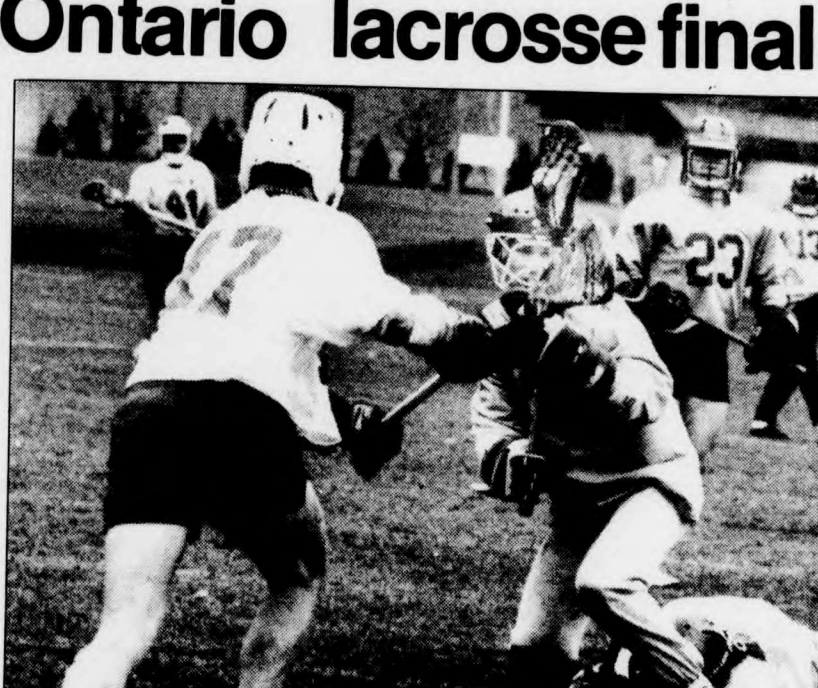
"EAT MY DUST!"! Western and Brock duel it out during the final game of the OUFLA championsips held at York last weekend. Western won the tournament.

Each team paid a fee to enter the tournament. The cost of lining the three west soccer fields alone was $480. Travel costs, hotels, and miscellaneous expenses are not a worry to major Varsity sports teams, they are problems that lacrosse players from