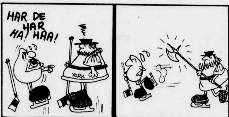
The Yeomen axe has fallen. Both the Hockey and Basketball teams hold first place.