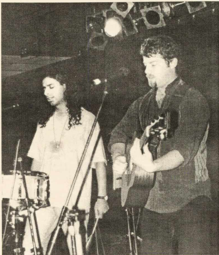
Moxy Frúvous at the Birdland

Dave: I guess kinda when we decided to quit our day jobs and get in the van and go on the road. This was in the late days of supporting the tape. It kind of