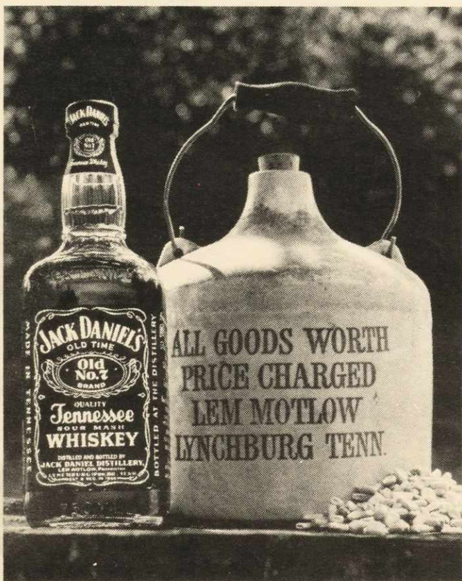
If you'd like a booklet about Jack Daniel's Whiskey, write us here in Lynchburg, Tennessee 37352, U.S.A.