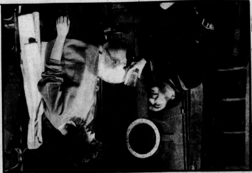
Scene from 'The Mystery of the Oak Island Treasure'