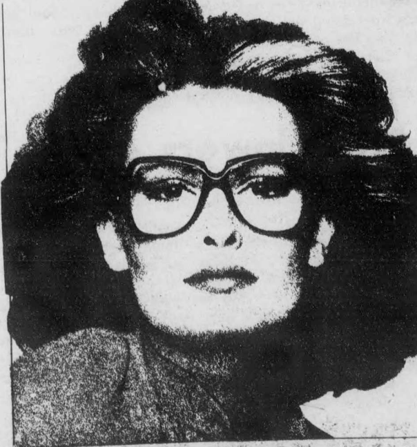
• prescription eyeglasses