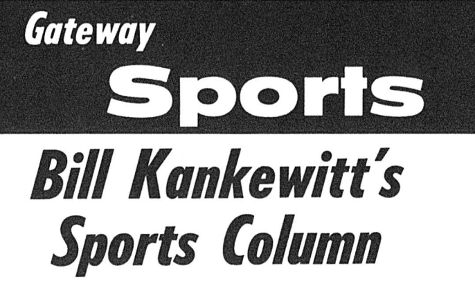
THE GATEWAY, Tuesday, September 17, 1968

NIAGARA FALLS-What do you do, you've got a day off, you're on the road and there's time to kill