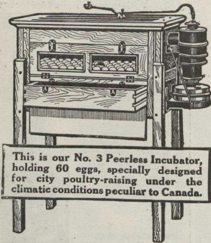
This is our No. 3 Peerless Incubator, holding 60 eggs, specially designed for city poultry-raising under the climatic conditions peculiar to Canada.

R AISING poultry on a city lot or in a backyard can be made far more than merely a fascinating hobby. It can easily be made a mighty profitable business that will bring you in a handsome revenue. At the same time knowledge of how to do it right will make the work doubly interesting. Now all that you need is knowledge—and the right kind of incubator. Yet these two necessities are both within your reach: for, by following the methods of The Peerless Way and adopting the Peerless Incubator, 20,846 Canadian poultry raisers are to-day making big cash profits. Do the same! Make poultry raising both your hobby and a business as well. Ride it as a hobby if you want to—but do more; make it yield you dividends and add to your bank account! You can do it. Remember that twenty thousand successful poultrymen have seen that our experience was worth having and following as operators of the