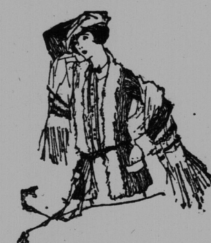
(Costume Dept., Second Floor.)

Manchester Robertson Allison Limited KING STREET GERMAIN STREET MARKET SQUARE