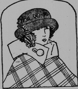
(Millinery Salon, Second Floor.)

Some of the nicest little tailored and semi-tailored hats you would want to see. Comfortable, close fitting shapes for blowy days and wider ones for any sort of weather. All the new bright and dull colors in the assortment; fashioned of felt, beaver, and soft fabrics. If you need a practical Fall and Winter hat, you certainly should not miss seeing these.