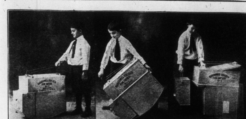
This is the only Ash Sifter fit to use in the house. Manufactured by THI BURROWES MFG. CO., 611 King St. West.. All hardware dealers. Phone Addide 1039.

Red Cross School of Nursing 358 Queen Street West, TORONTO - - CANADA.