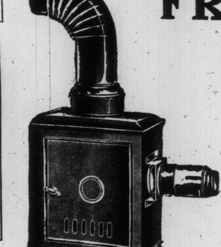
FREE Prize to Boys

This splendid Magic Lantern, Ru sian iron body, brass and nickel finitens tubes. Complete with 12 slides Send us your name and address a we will send you 30 sets of beat embossed Easter, and other posts to sell at 10 cents a set (six beat cards in each set). When sold us the money, and we will send you lantern, all charges prepaid.