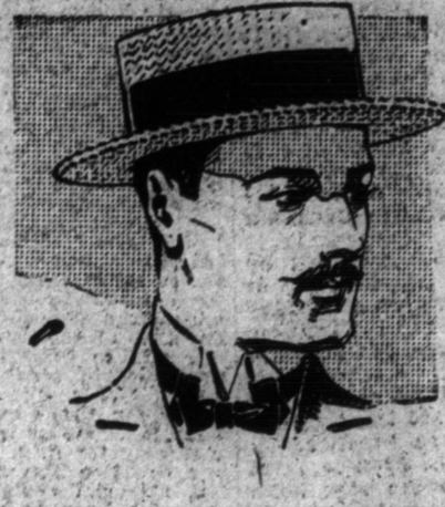
$2.00—An English-made Boater, made from fancy straw, with 3-inch crown and 2 1/4-inch brim, black corded ribbon and hat-guard.