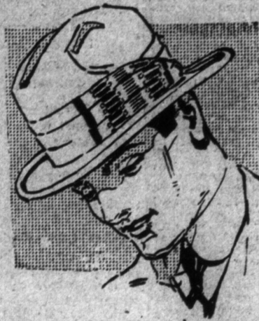
$4.25—This is a very special value in a fedora Panama, made of a clean white fibre with rope edges, brim slightly dipped in front and back, and trimmed with fancy Palm Beach band.

This American Boot is similar in lines to the Oxford described above, but even