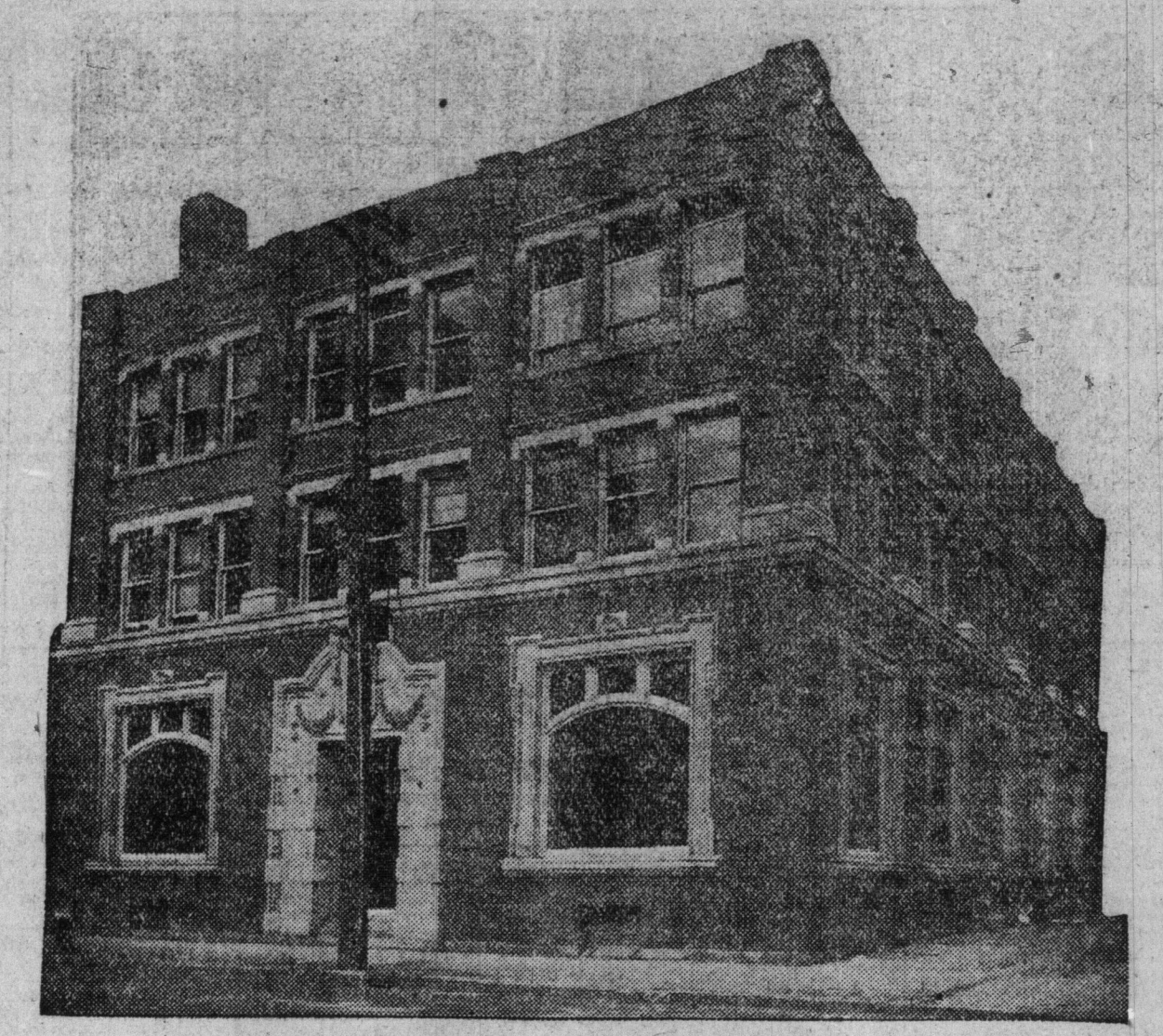
View of The World's New Home As It Is At Present. Four More Storeys Are To Be Added, Which Will Make the Building as it Appears on the Front Page. The World Square is on the Right Looking North to Queen Street.

There will always be the clever individual who is going to load up the newspaper man with a bit of special pleading more or less cleverly disguised as a "story" of actual news value.