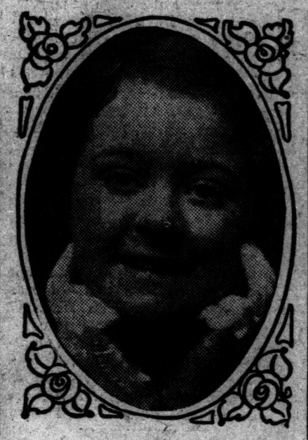
of the children in "Mrs. Wiggs of the Cabbage Patch."