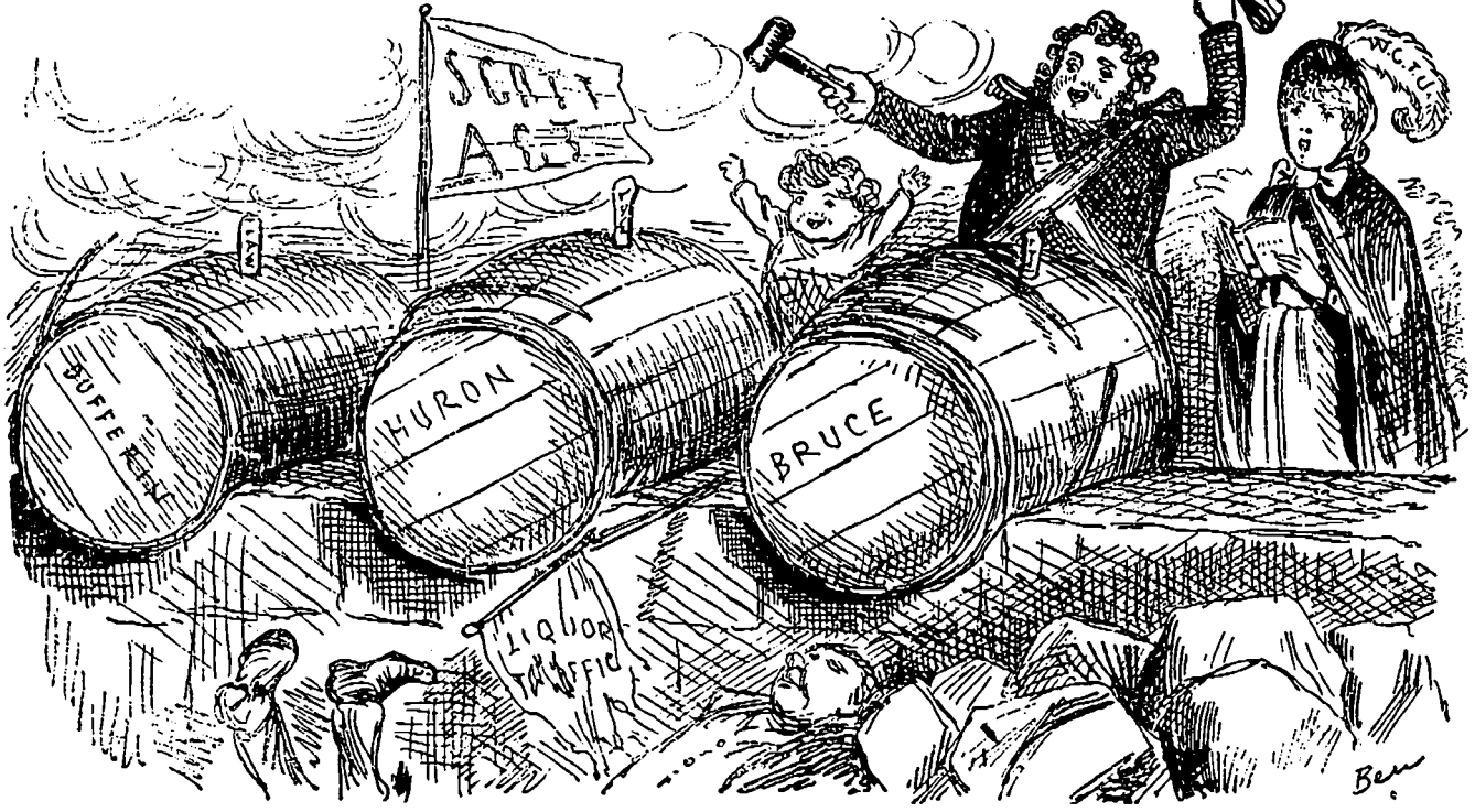
THREE MORE GUNS SPIKED!

An' how de reporters am goin' to make up for de loss ob de daily item of police court drunks. I can't think nohow. It am awful to think about. Drefful! Wages will go down, bekase de men who drink now will be in de labor market den; de city will hab to be at de onnecessary expense ob providin' more school accommodati'n fur de chillen ob unfortunate parents, who hab been made sober by de law, de law ob "can't get it." Desc chillen don't go to school now, dey will den—why de news-boys' ranks will be decimated. "Father's a drunkard, and mother is dead," won't apply den. We shall miss, too, oh! how much, dat familiar figure, behind de bar, or in de doorway, slick, smiling and debonaire; waiting for some old woman to come along wid five cents in her shakin hand, and a pop bottle under her shawl; de jingle ob his heavy watch chain, or de cheerful jollity of his jokes as he hands over the liquor an' pockets de nickels, we shall hear never more. It really am too bad, de folks am got Prohibition on de brain, dey am huntin' de liquor fox from post to pillar, from brake to cover, till here, in de Queen City itself, rings out de infernal prohibition tally-ho! Too bad! Dis po' kentry will be clean done ruined. What you 'spose de Finance Minister am goin to do widout de revinue deriv from de destruction ob de people? I ax you—what de perfession ob law am goin' to do about it? Dat ar perfession we