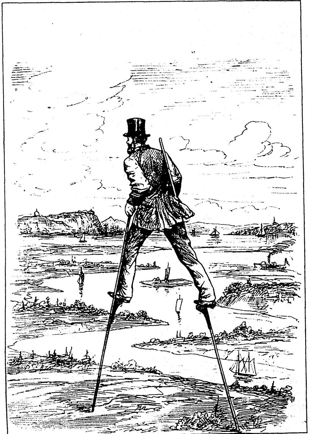
SPECIAL TRAIN OF THE M. P. P. FOR MONTREAL WEST TO SAVE THE GOVERNMENT.

WILLIAM DOW & CO. BREWERS and MALTSTERS MONTREAL.