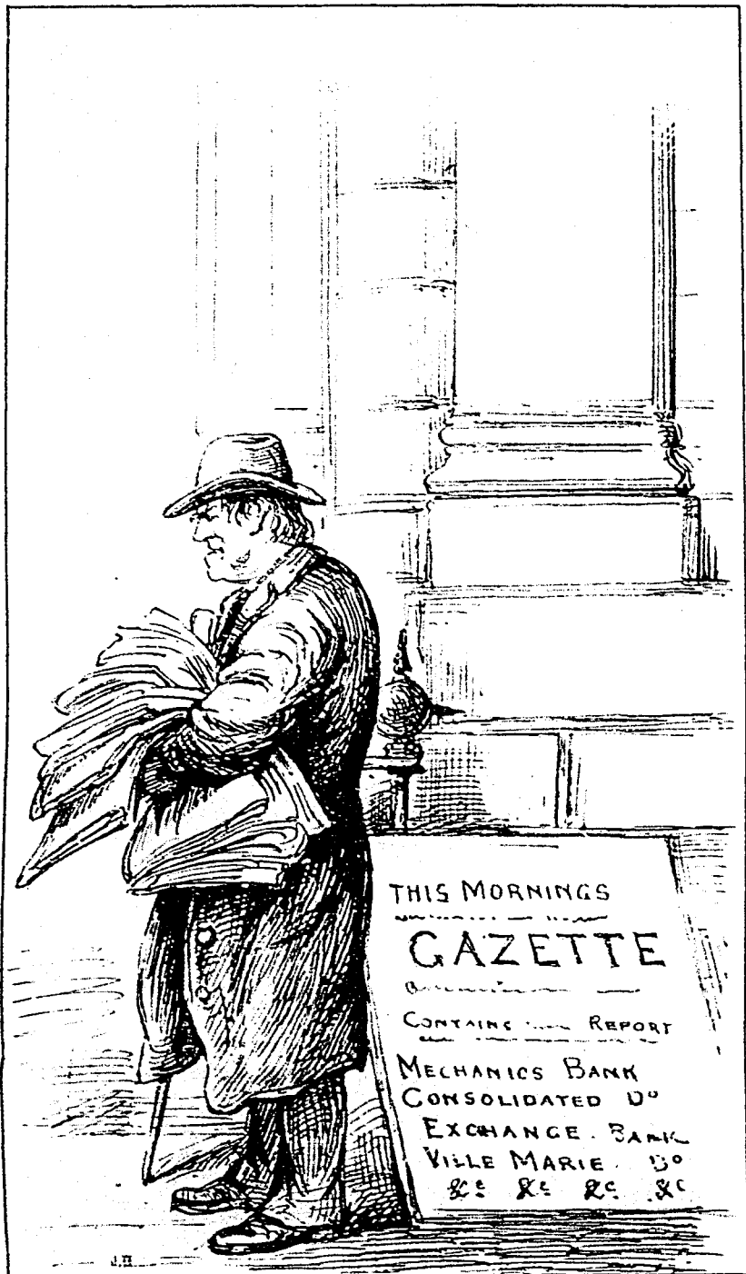
THE OLD NEWSBOY.