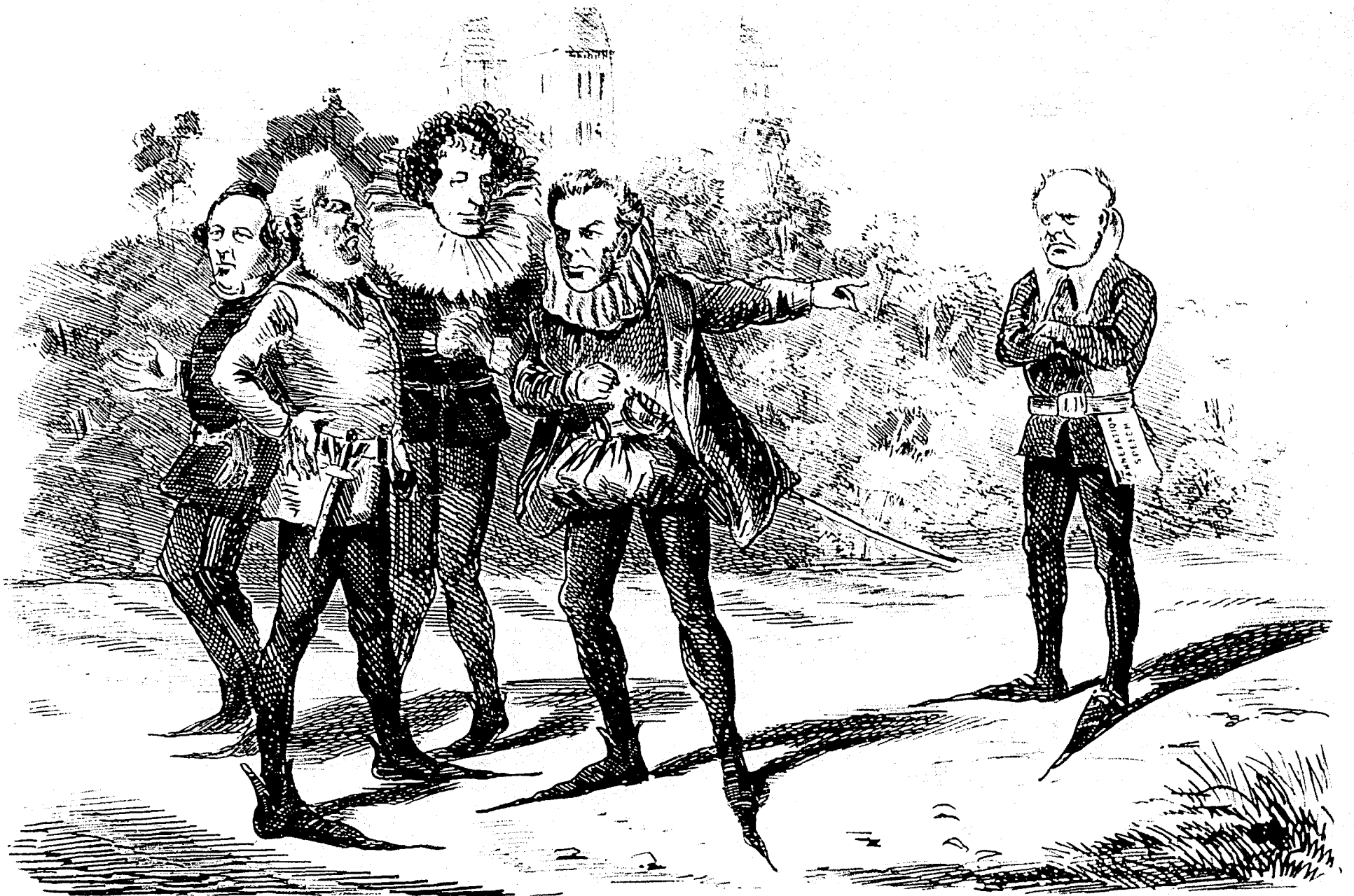
SHALLOW.—"I have lived fourscore years and upwards; I never heard a man of his place, gravity and learning, so void of his own respect."