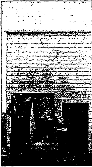
E. F. HUTCHINGS' FIRST WINNIPEG SHOP

manufactured goods and here the variety is almost as great as among the imports. A novel system of shelving for the storage of harness, etc., is in use on this floor, whereby the stock can be closed up in dustproof compartments and yet as accessible as if displayed on counters or tables.