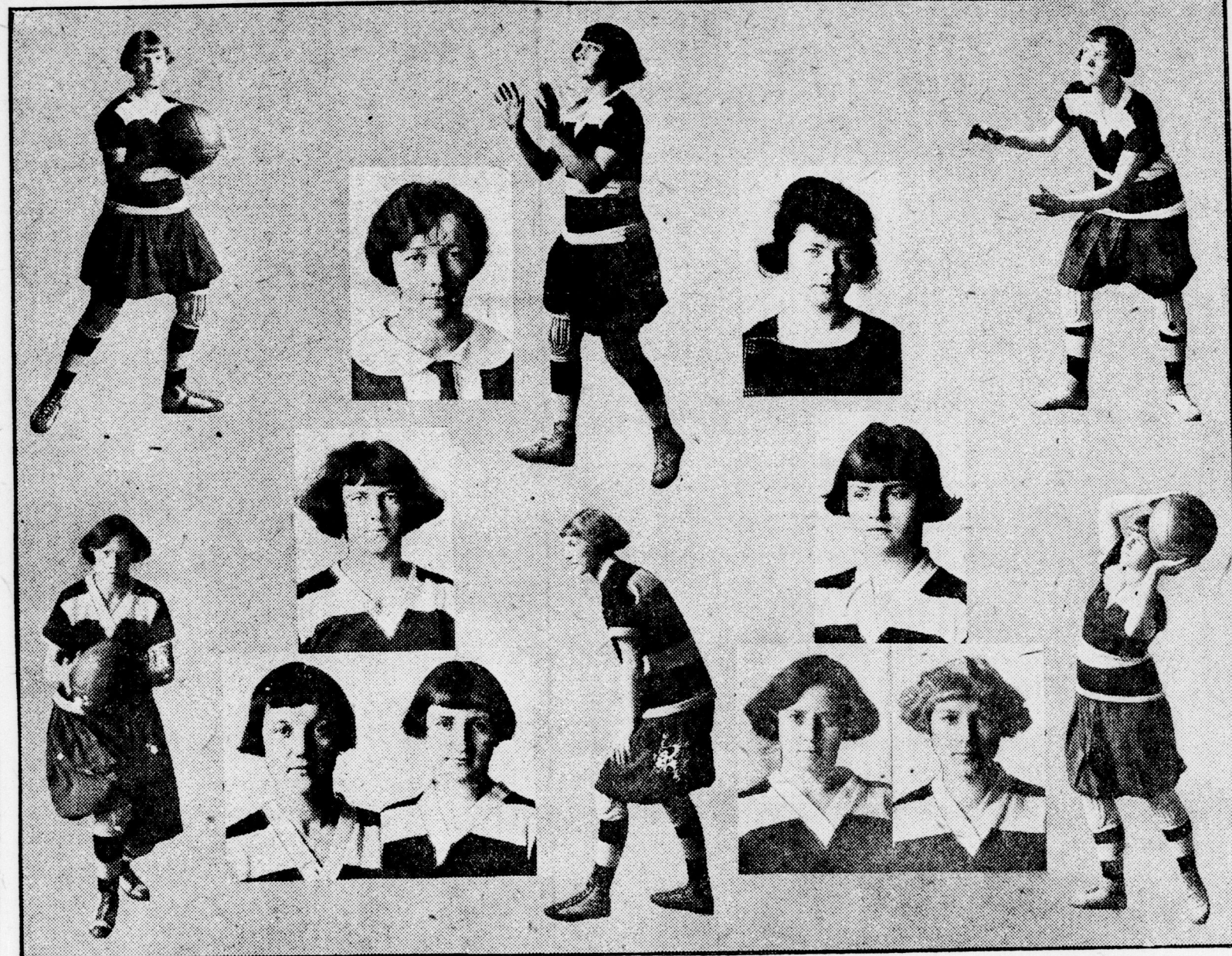
MEET TORONTO Y. W. H. A. QUINTET SATURDAY.

In district 10, Amherstburg is the winner and has reached the inter-district games, having won from the Windsor-Walkerville Technical. Their next opponents will be the winners of the Forest-Sarnia series, which games are being played this week. In the second round, St. Thomas vs. Tillsonburg, the latter team won out. A surprise was handed out in the inter-district second round. Mitchell vs. Woodstock, the first game being played in Mitchell Friday, and the home team winning 8 to 3. This places a different aspect on the results, for Mitchell is the surprise team of the W.O.S.S.A. hockey year, and the outcome of the return match at Woodstock will be watched with interest.