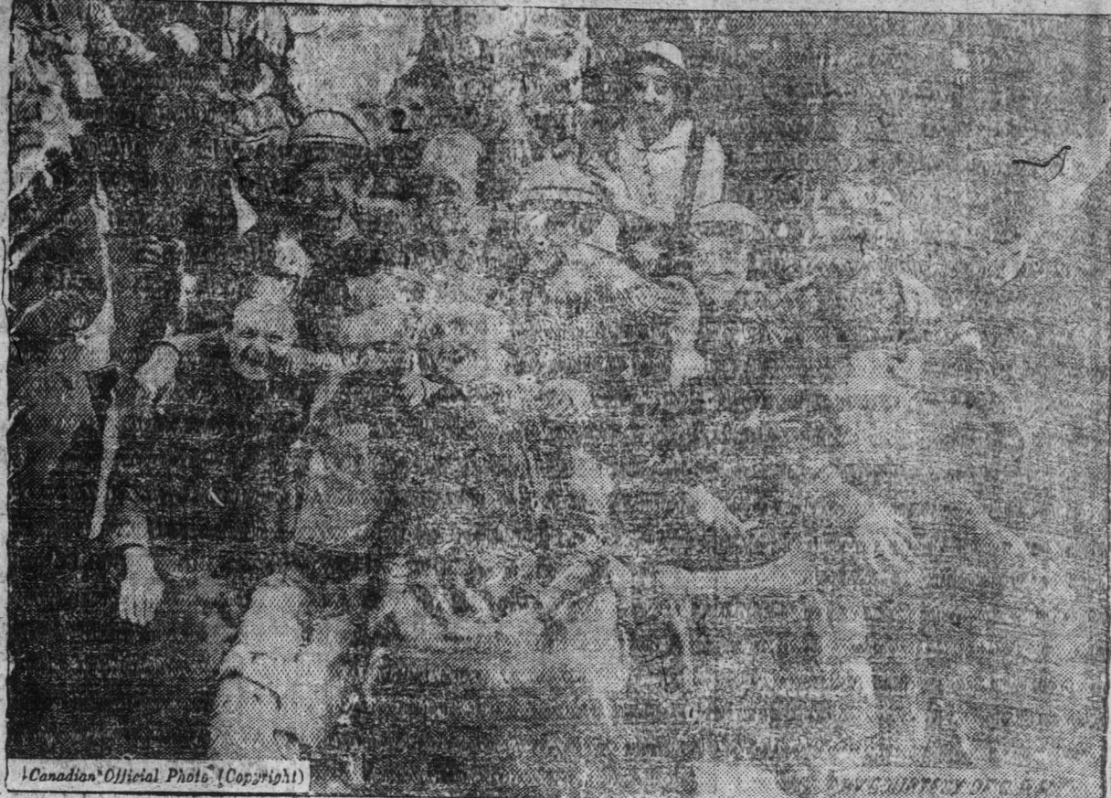
Residents of Soudemont, France, are glad to be released by the Canadians, after living in the village with the Germans for four years.