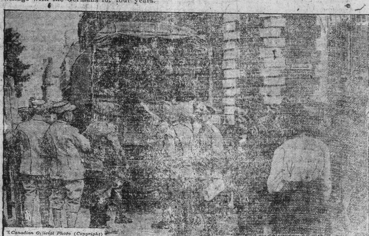
French civilians released by Canadians leaving for a village far from German shells and Kultur after living four years under German rule.