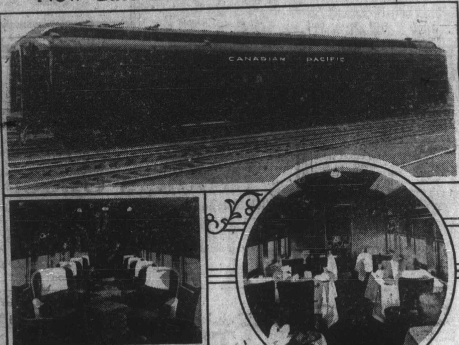
Above—Exterior Cafe-Parlor Car Left—Interior of the parlor. Right—The dining room.

Of the best of modern improvements to railway service in Canada are the Canadian Pacific combination dining and parlor cars. The new all-steel cars, six in number, will operate on the more important short runs, affording every convenience and luxury, where full size dining and parlor cars are not required.